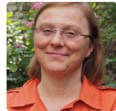
Gina Ebner General of EAEA

EAEA represents non-formal adult education with 141 member organisations in 45 countries. EAEA promotes adult learning and access to and participation in non-formal adult education for all, particularly for groups currently under-represented.